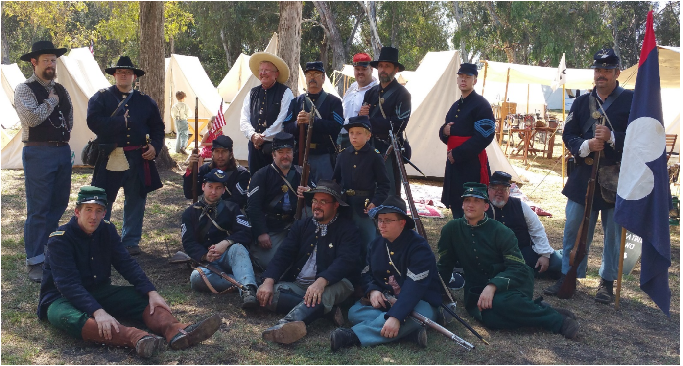
Officers and NCOs of the various Federal Units in the ACWS