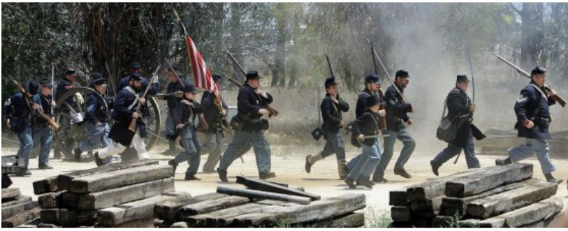
Union soldiers charge advancing Confederate soldiers Sunday, May 22, during a Civil War reenactment at the Orange Empire Railway Museum in