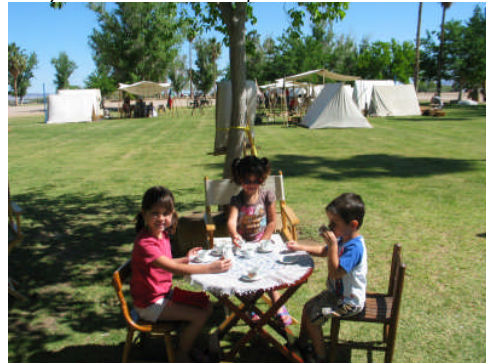
Local children having a tea party.

Due to the sudden death of a dear friend two days before the event, I was not able to attend the reenactment in Costa Mesa. I hope it went well and I am anxious to hear from our members their impressions.